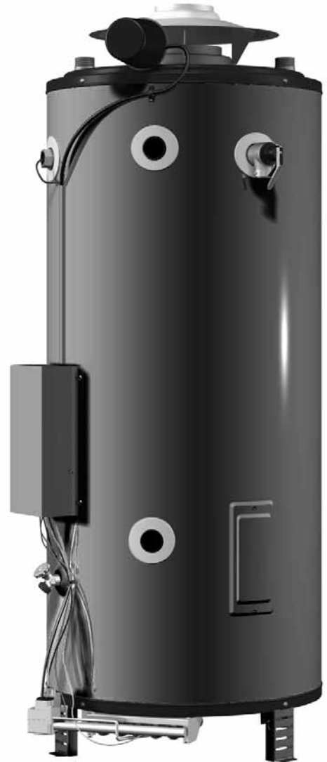
BCG3-70T120-6N through BCG3-100T390-8N pictured