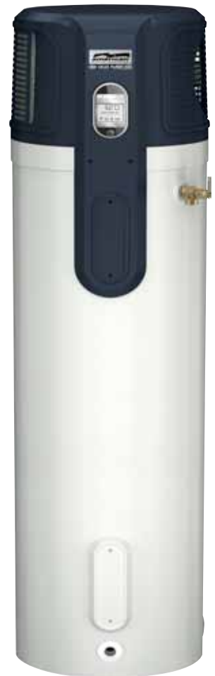
HPE6280H045DV Model Shown