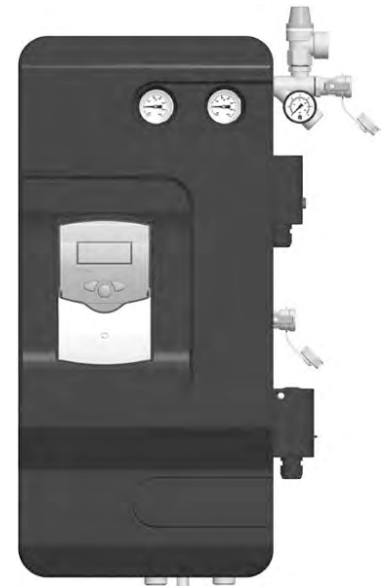
Double Wall Pump Station