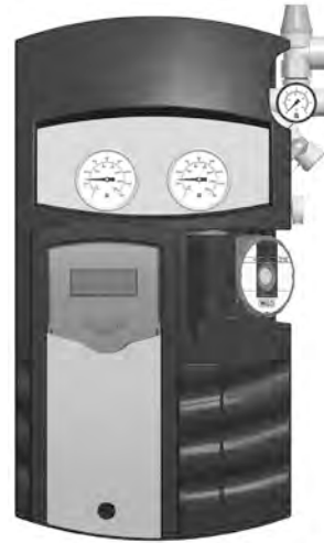
Standard Pump Station