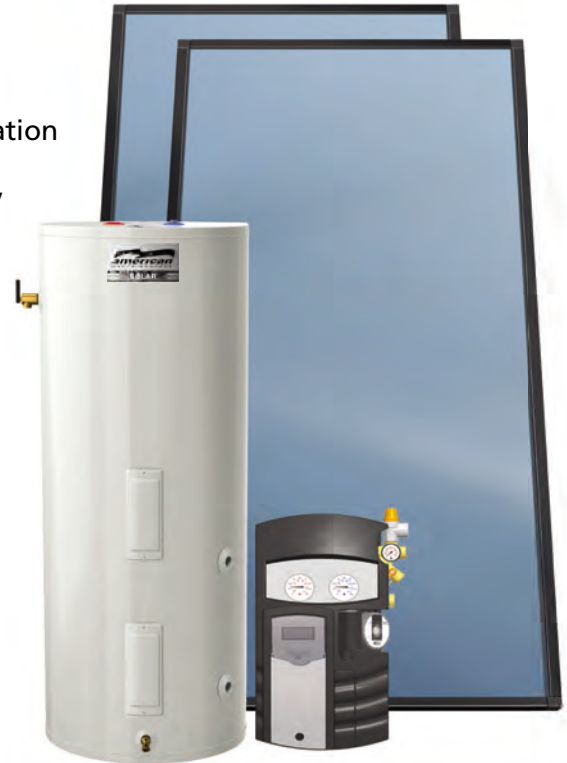
Model shown SSX62-ACI-220